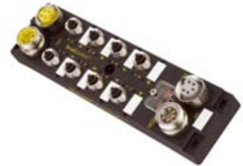
Brad® HarshIO 600 sDN I/O Module Classic

Brad® HarshIO DeviceNet modules provide a reliable solution for connecting industrial controllers to I/O devices in harsh duty environments. Contained in an IP67 rated housing, Brad® I/O modules can be machine mounted and are able to withstand areas where liquids, dust or vibration may be present. This makes them ideally suited for many applications including material handling equipment and automated assembly machinery.